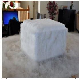
Sublimation (Dry Ice)